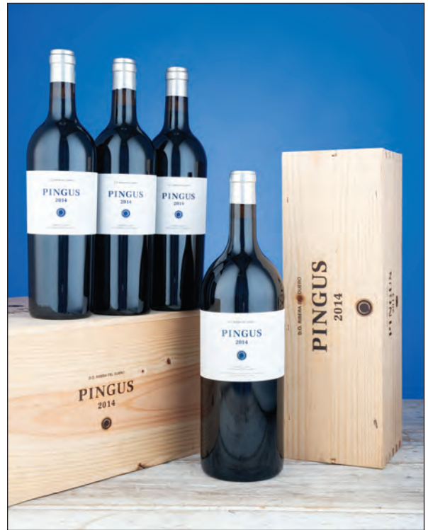
Lots 510, 515